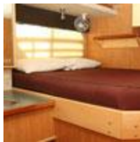
Stateroom w/ Vanity