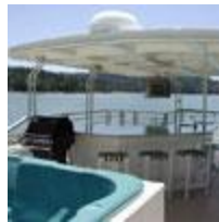
Top Deck 2