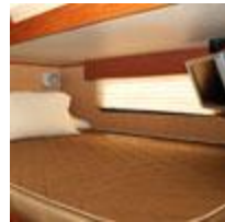
Stateroom w/ Bunk