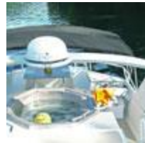
Top Deck 2